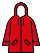
Light rain jacket