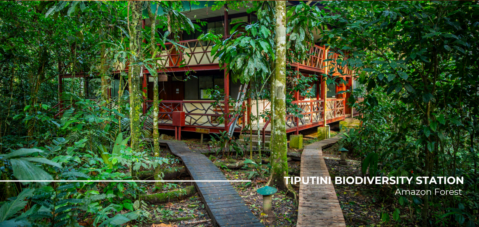
TIPUTINI BIODIVERSITY STATION Amazon Forest