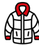
Sweater or hoodie