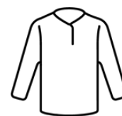
Clothes for layering