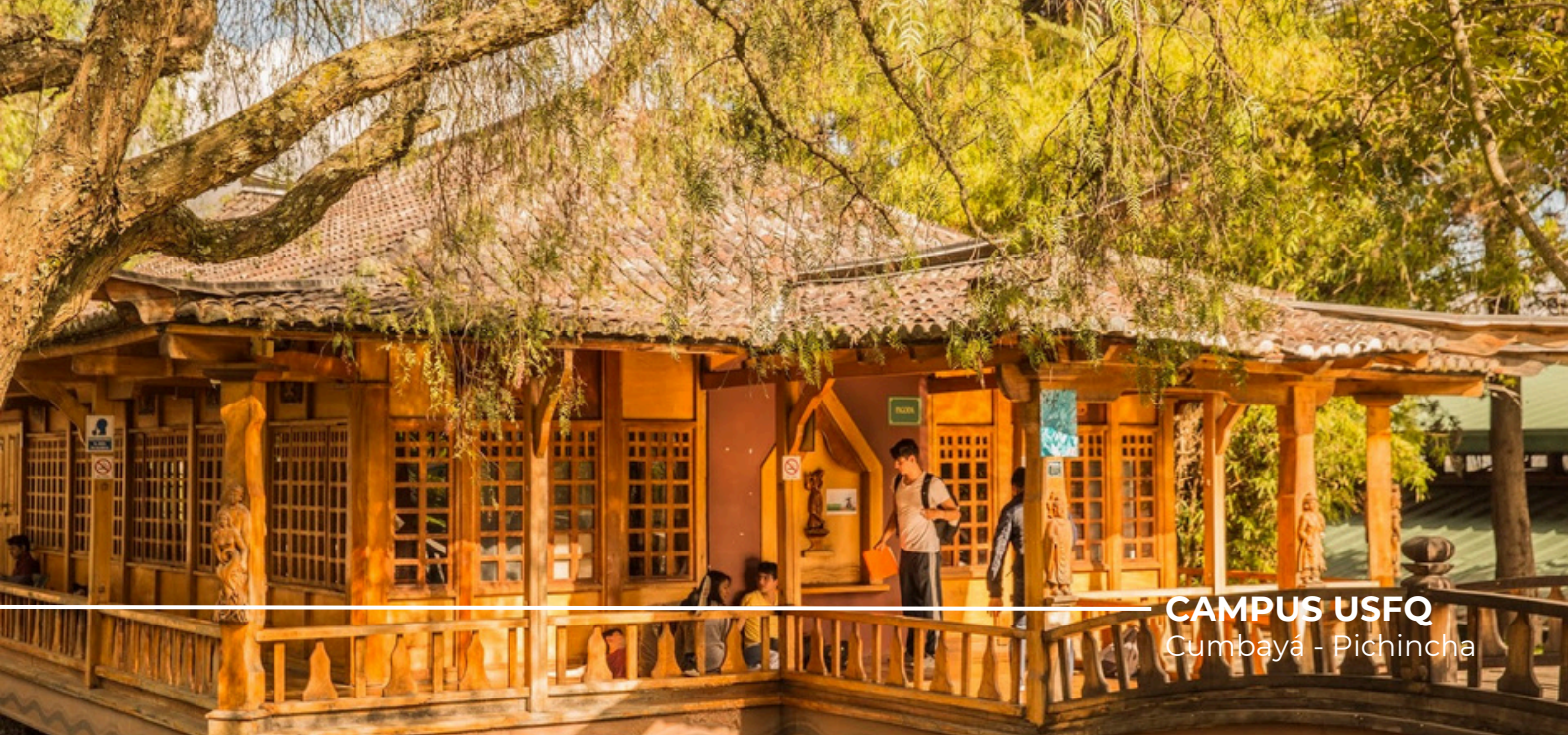
CAMPUS USFQ Cumbayá - Pichincha