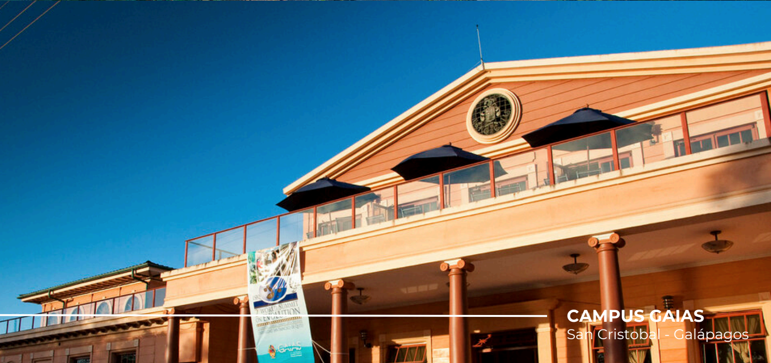
CAMPUS GAIAS San Cristobal - Galápagos