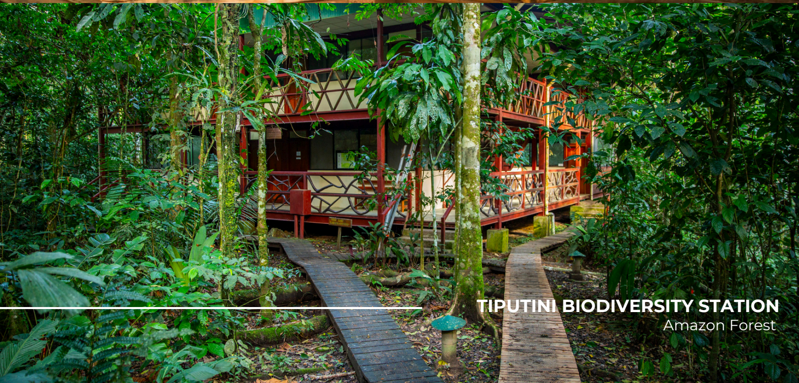
TIPUTINI BIODIVERSITY STATION Amazon Forest