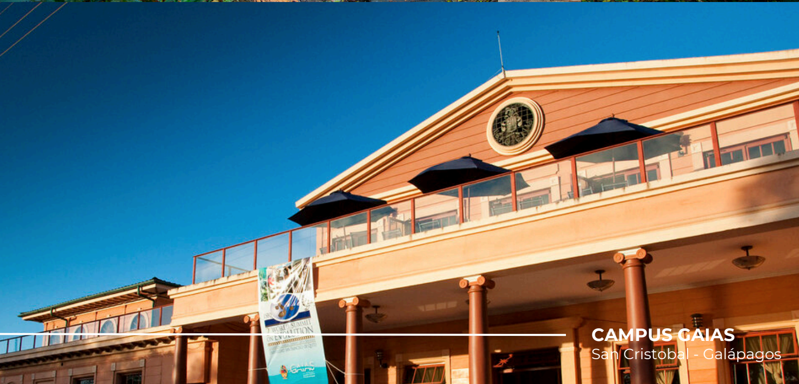
CAMPUS GAIAS San Cristobal - Galápagos