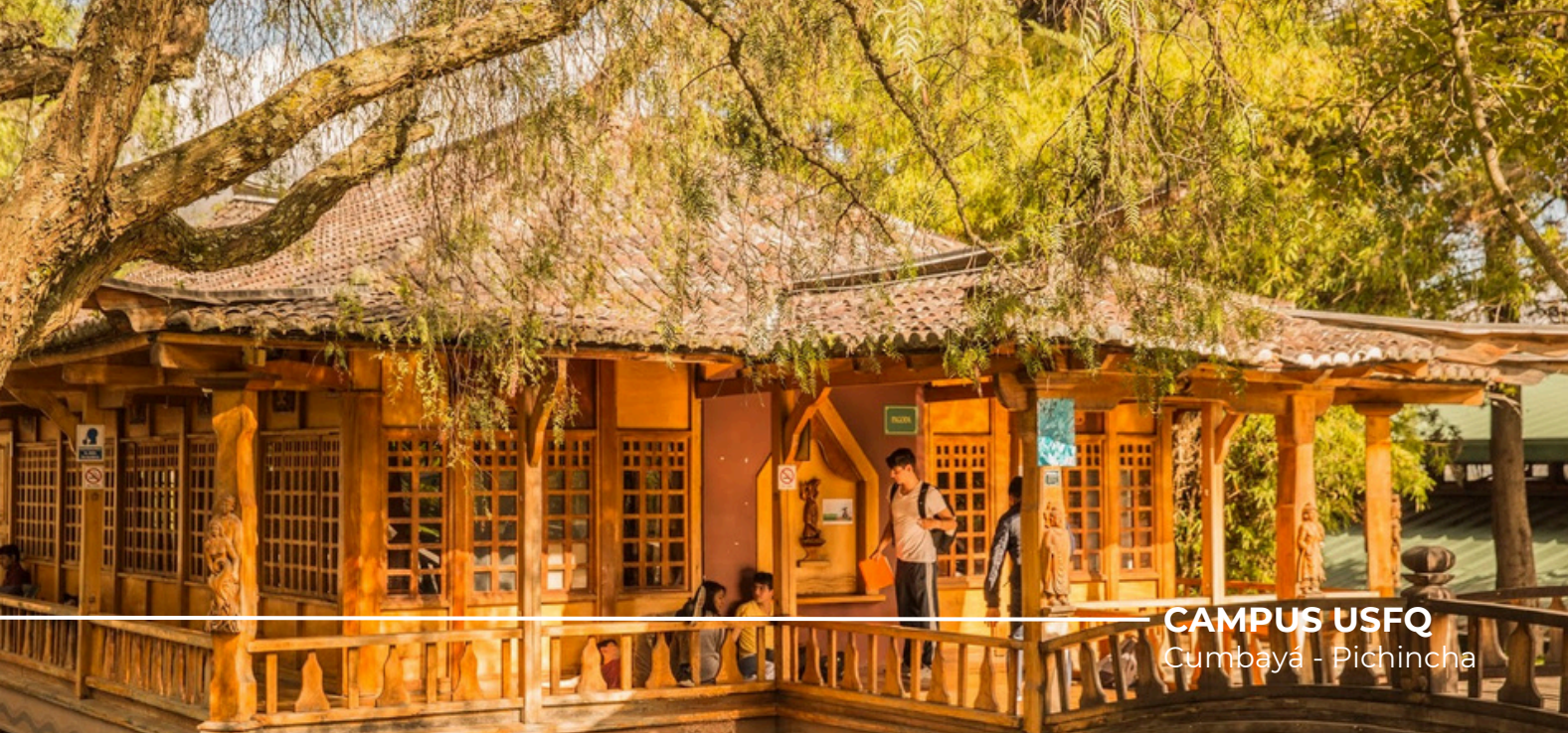
CAMPUS USFQ Cumbayá - Pichincha