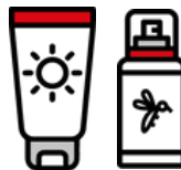
Sunscreen 30+SPF & Bug Spray