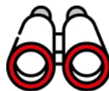
Camera or binoculars